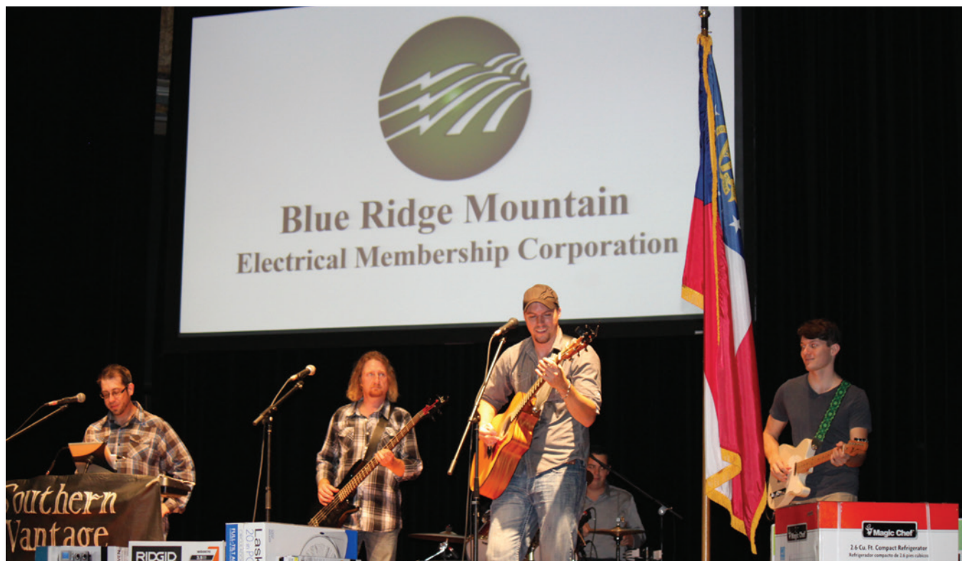
Southern Vantage provided wonderful musical entertainment at the 2016 Annual Meeting.